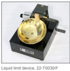
Liquid limit device, 22-T0030/F