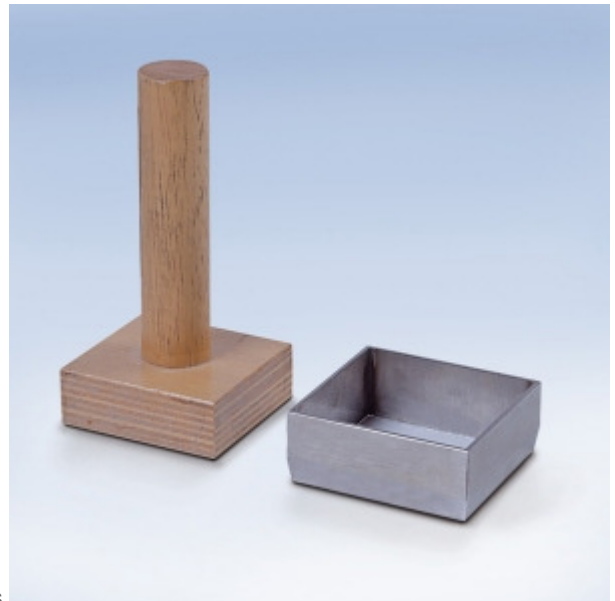
Shear box parts