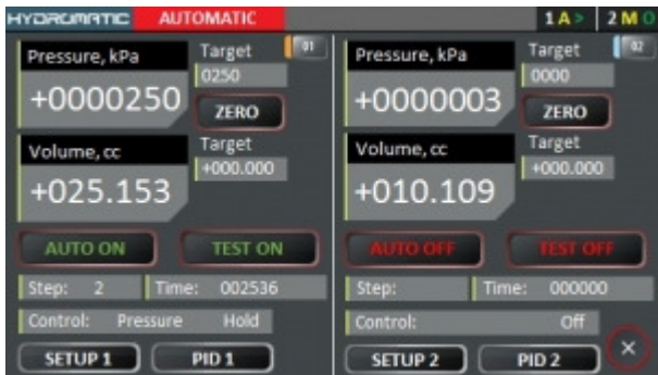
Auto Control ( screenshot ) Automatic execution of pre-programmed steps of pressure and/or volume change