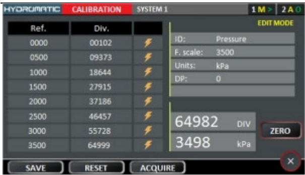
Calibration ( screenshot ) , for display, editing and saving the calibration numbers