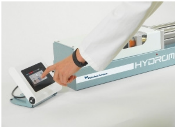
The control panel is removable and can be located according to the user's