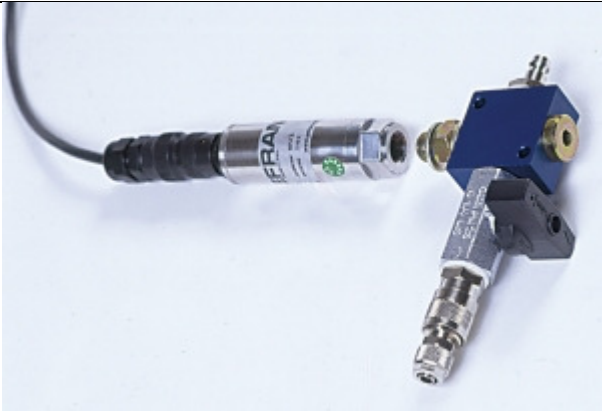
Pressure transducer and de-airing block included