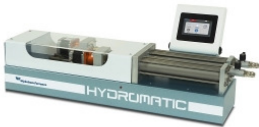
Pressure/volume controller HYDROMATIC standalone two Hydraulic pressure

Nylon tubing 6 mm bore x 8 mm outside diameter, 10 m long.