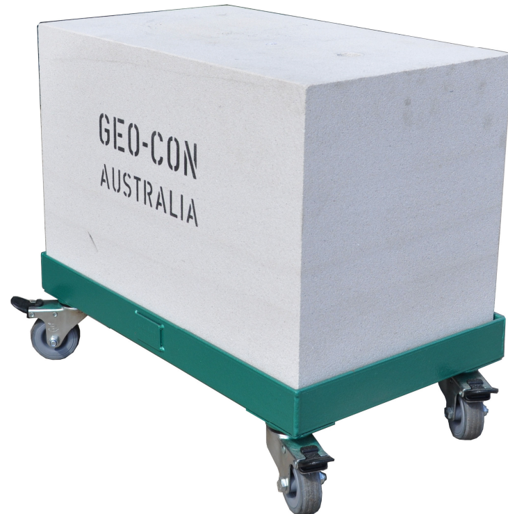
Secondary Density Block & Trolley