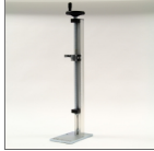
Andreasen pipette stand 22- T0062/2A