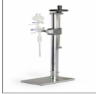
Andreasen pipette (47-D0439/B) and stand (22-T0062/2A)