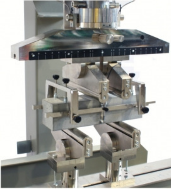
Beam deflection and toughness test, detail of auxiliary frame (50-C1200/5) fitted with two displacement transducers (P0331/C)