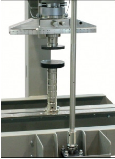
300kN UNIFLEX frame (50-C1601/FR) fitted with accessory for compression tests (50-C1601/4 and 50-C1601/KIT)