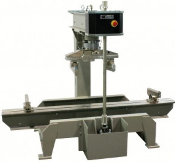
300kN UNIFLEX frame (50-C1601/FR) with bearers (50-C1601/1)

Supply of the compression deice model 50-C1601/4 complete with traceable certificate of hardness of 165 mm dia. platen surfaces