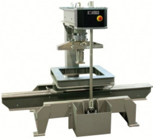
absorption tests on square slab (50-C1601/6B)

300kN UNIFLEX frame (50-C1601/FR) fitted with accessory for energy