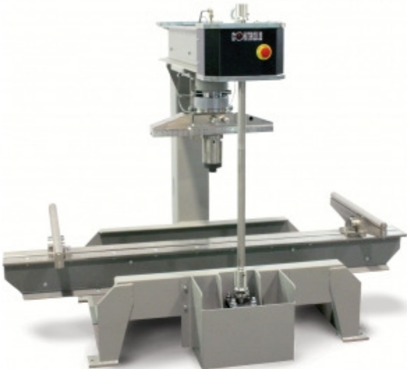
(50-C1601/2, 50-C1601/3, 50-C1601/KIT)