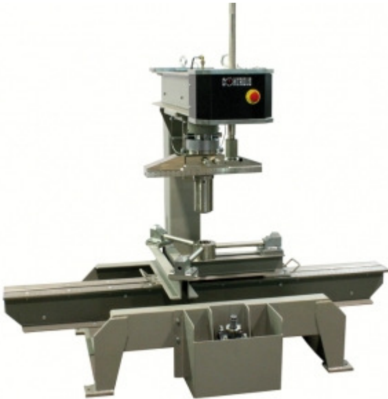
absorption tests on round slab (50-C1601/7)

300kN UNIFLEX frame (50-C1601/FR) fitted with accessory for energy