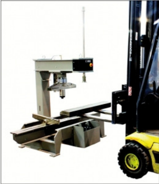
Easy specimen loading with fork lift