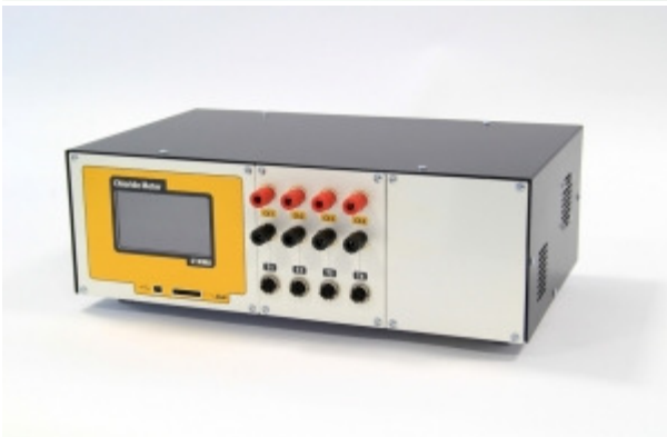
Chloride penetration meter, 4 channels model 58-E5204