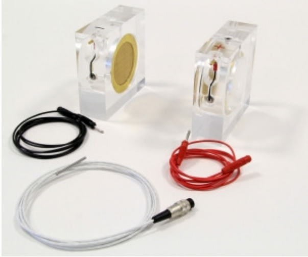
Complete test cell for chloride ion penetration meter including heads,

temperature probe and cables code 58-E5220