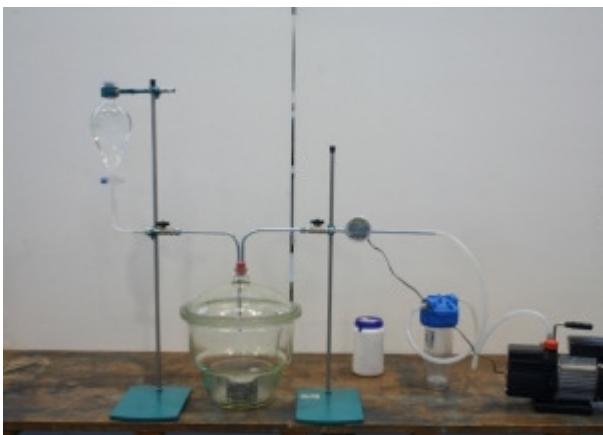
Vacuum saturation apparatus required by ASTM C1202 in order to fully

saturate the specimen with water, model 58-E0052/1