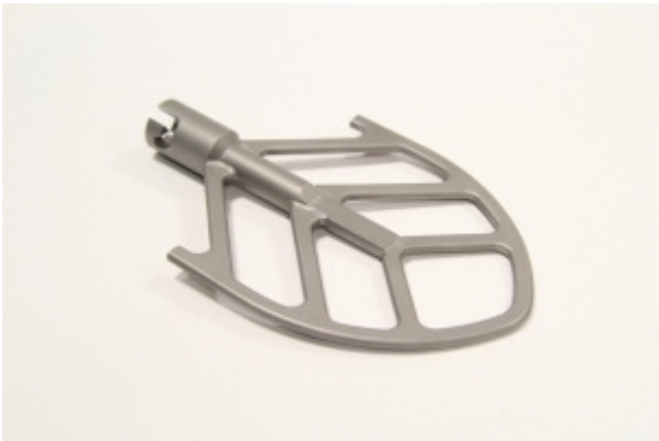
Stainless steel beater conforming to EN 196-1, model 65-L0512/EN