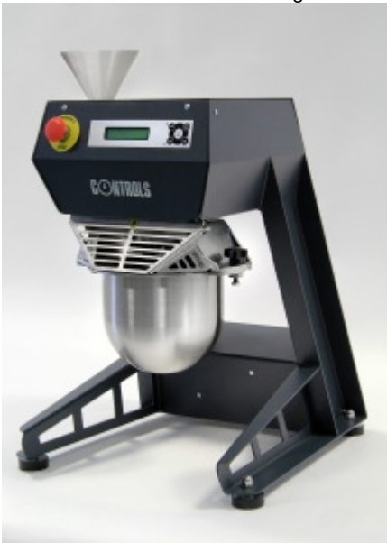
Digital mortar mixer model 65-L0502 complete with bowl and stainless steel beater conforming to EN Standards and open-type sand hopper (as accessory)

Stainless steel beater conforming to EN 196-1