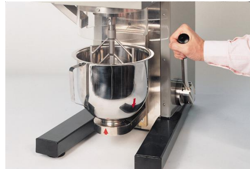
65-L0006/AM Detail of the bowl displacement by a vertical slide guide