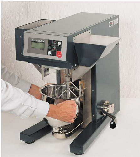
65-L0006/AM Easy removal of bowl and beater