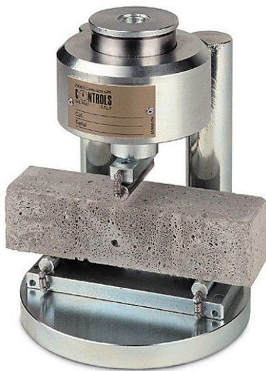
65-L0019/B Mortar Flexural Test Frame

Distance pieces to adjust the vertical daylight