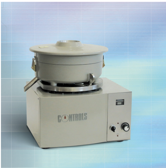
75-B2212 / 75-B2312

Electromagnetic system to prevent the opening of the cover during rotation conforming to CE directive. Suitable for 75-B2212 and 75-B2312 standard models only. To be factory installed and specified at time of order