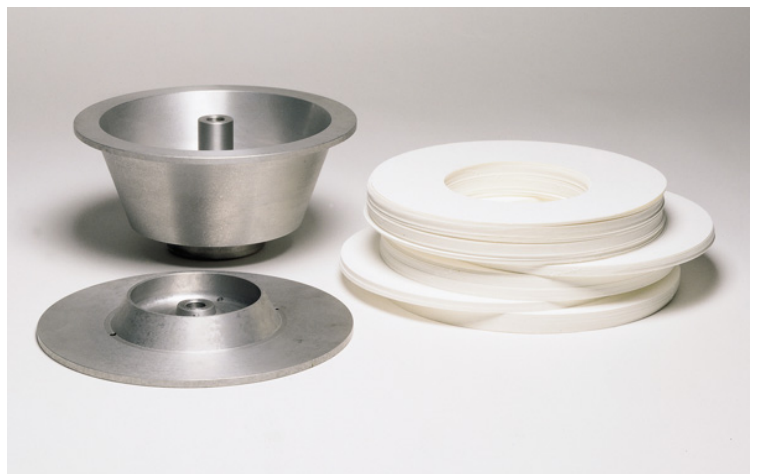
75-B0022/2 & 75-B0022/1 Spare bowl/cover and filter discs