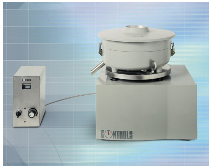
75-B2222 / 75-B2322. Explosion proof models