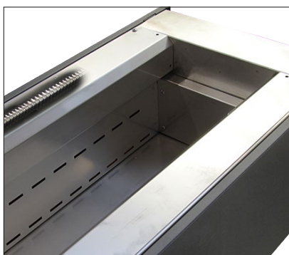
Detail of the stainless steel water bath with the protection for the lateral driving screw rods, by stainless steel too.

This model fully satisfies and exceeds ASTM D113, ASTM D6084, AASTHO T51 and EN 13398 requirements. To obtain the required 25°C with ±0.2°C tolerance, circulation of cold water is necessary. A water chiller (see accessory 81-PV1002) is ideal for this and may already be available in the laboratory but mains water can also be used. If the ambient temperature goes over 25°C, as in tropical areas, and cold mains water is not available, the use of a water chiller is mandatory.