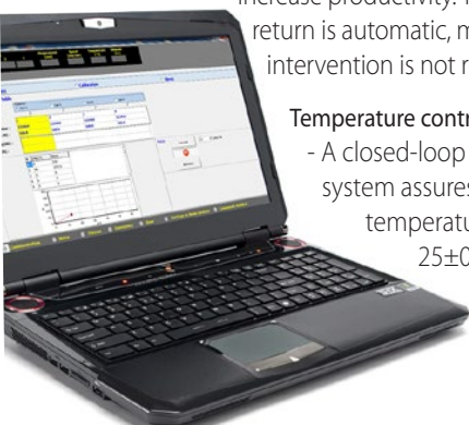
Typical screenshot of the machine software

As above but 110 V, 60 Hz, 1 ph. For technical specifications please refer to page 7.