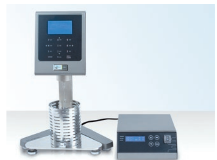
Temperature control unit 81-PV0118/T

Rotational Viscometer, high performance version, calibration certificate, USB, WIFI, Bluetooth, temperature sensor, datalogger software and power supply cable. Viscosity range 100-40 000 000cP, rotational speed 0.01-200rpm. 100-240V/50-60 Hz/1ph.