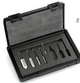
81-B0118/4 Spindle kit