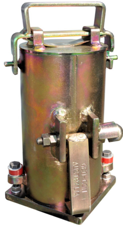
Geo-Con Concrete Cylinder Mould Lids and Handles sold separately