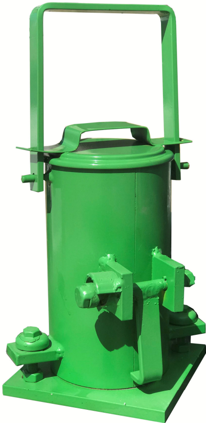
Imported Concrete Cylinder Mould Complete with Lid & Handle