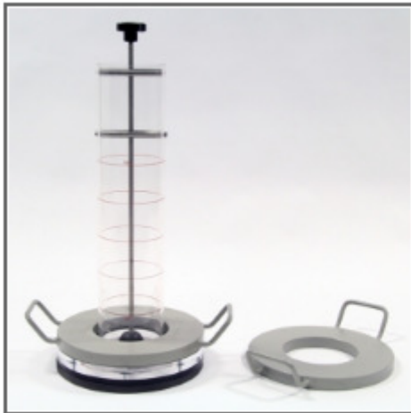
Falling head permeameter