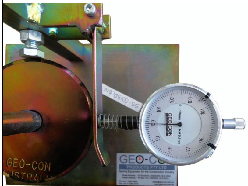
Diameter is read directly off the dial gauge (the picture shows the Calibration Jig in place and the Dial is set to read a diameter of 100mm)