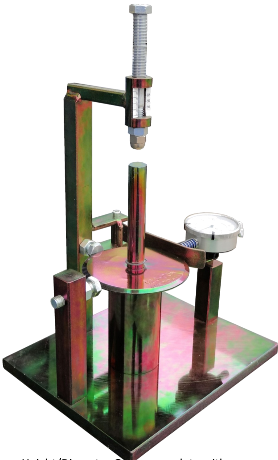
Height/Diameter Gauge complete with Calibration Jig in place