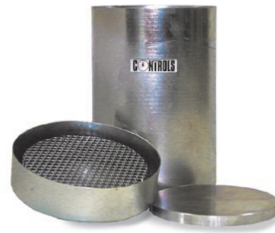
48-D0457: Metal can for thawing and freezing aggregates