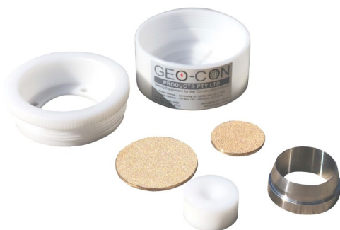
Consolidation Cell, Porous Plate, Cutting Ring & Pressure Spacer