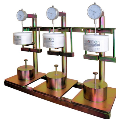
3-Gang Set-up made for wall mount or bench top use