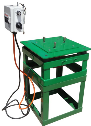
Max/Min Vibrating Table shown fixed to Extension Frame for 'stand alone' operation