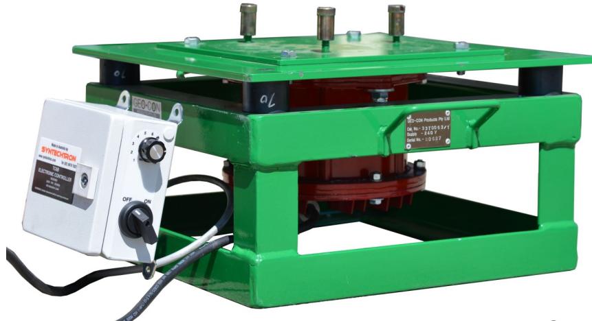
Max/Min Vibrating Table with Amplitude Variation Controller 33-T0063/1.CON

Equipment for Max/Min Dry Density Test : AS1289.5.5.1