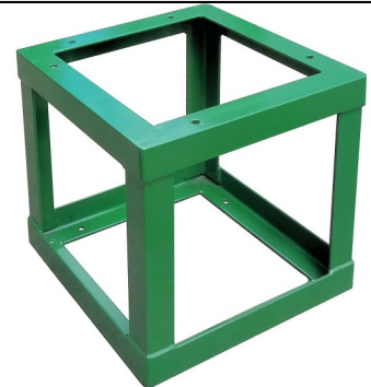
Extension Frame 33-T0063/1B.CON