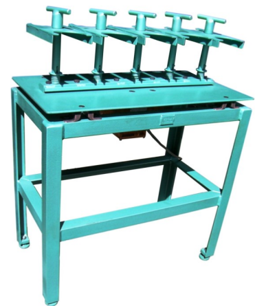
Electric stationary (3 ph. 10 cylinder clamp)