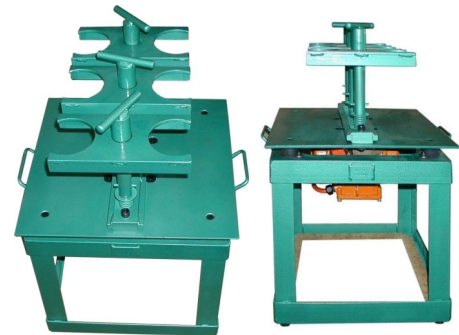
Bench Top Electric Vibrating Table.