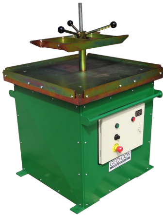
GC 17 HD Vibrating Table (Variable amplitude & frequency)

Geo-Con can manufacture vibrating tables to a customers specific requirements—these not stand-ard items and sufficient time must be given for their production. Some examples are given below.