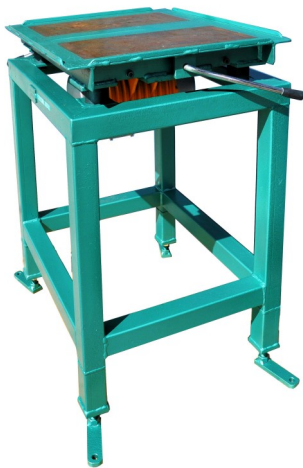
Double magnetic (1 ph. with lock down adjustable feet)