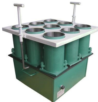
Portable (12V D.C.) Vibrating Table