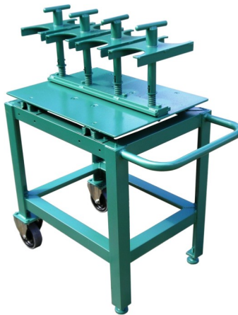
Electric movable (1 ph. 8 cylinder clamp)