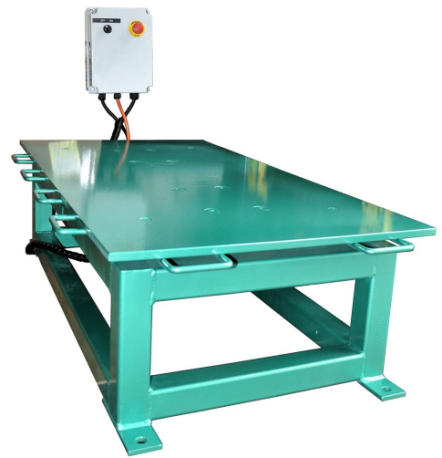
EHDSleeper Vibrating Table (3ph. dual counter-rotating vibrating motors)

Clamping Systems can be design to suit Clients requirements