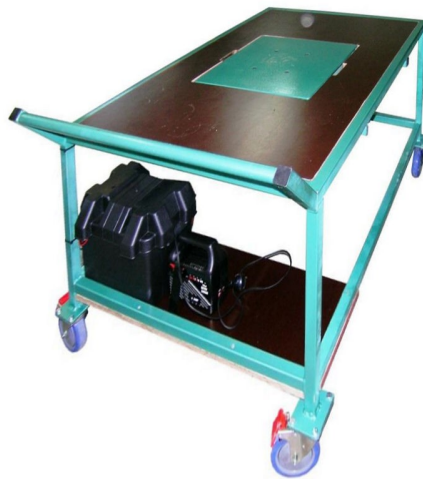
Trolley mounted (12V D.C. with rechargeable battery)