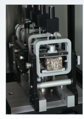
AsphaltQube Four Point Bend Jig

loop control and a run time adaptive control algorithm that adjusts the command signal during the running of a test.